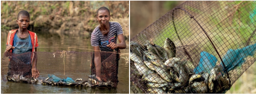
L. to r.: Fish trap in action – left for 2 hours in the pond.

The total yields under this combination were 25 percent higher than in the control group with single batch harvest. A higher stocking density (3 fish/ m 2 ) led to a slightly higher total harvest in the control group, but to a lower net profit. The use of pellets reinforced both effects and was the least economical.