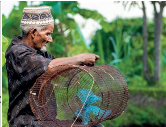
Picture: Preparing the fish trap.