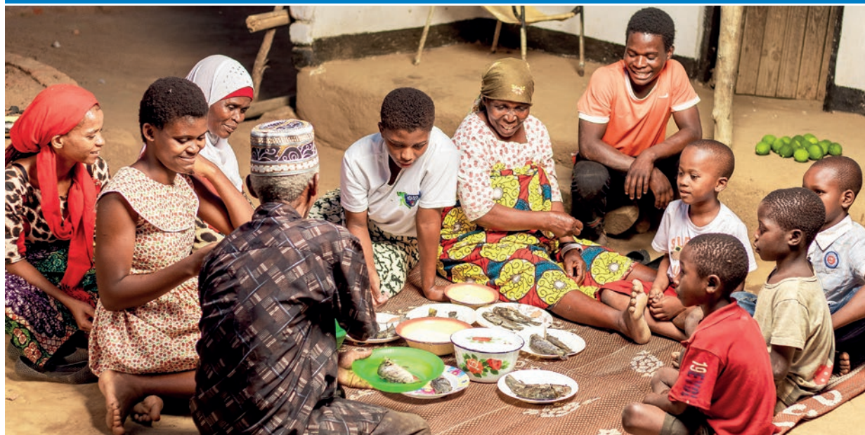
Picture: Family eating fish for lunch.