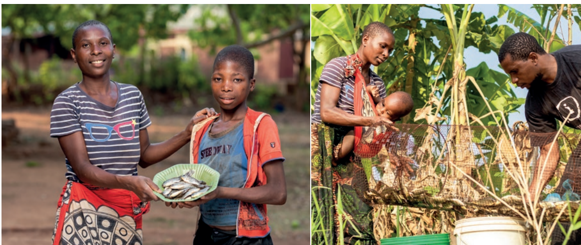
L. to r.: A family shows their “catch of the day” for their own consumption.