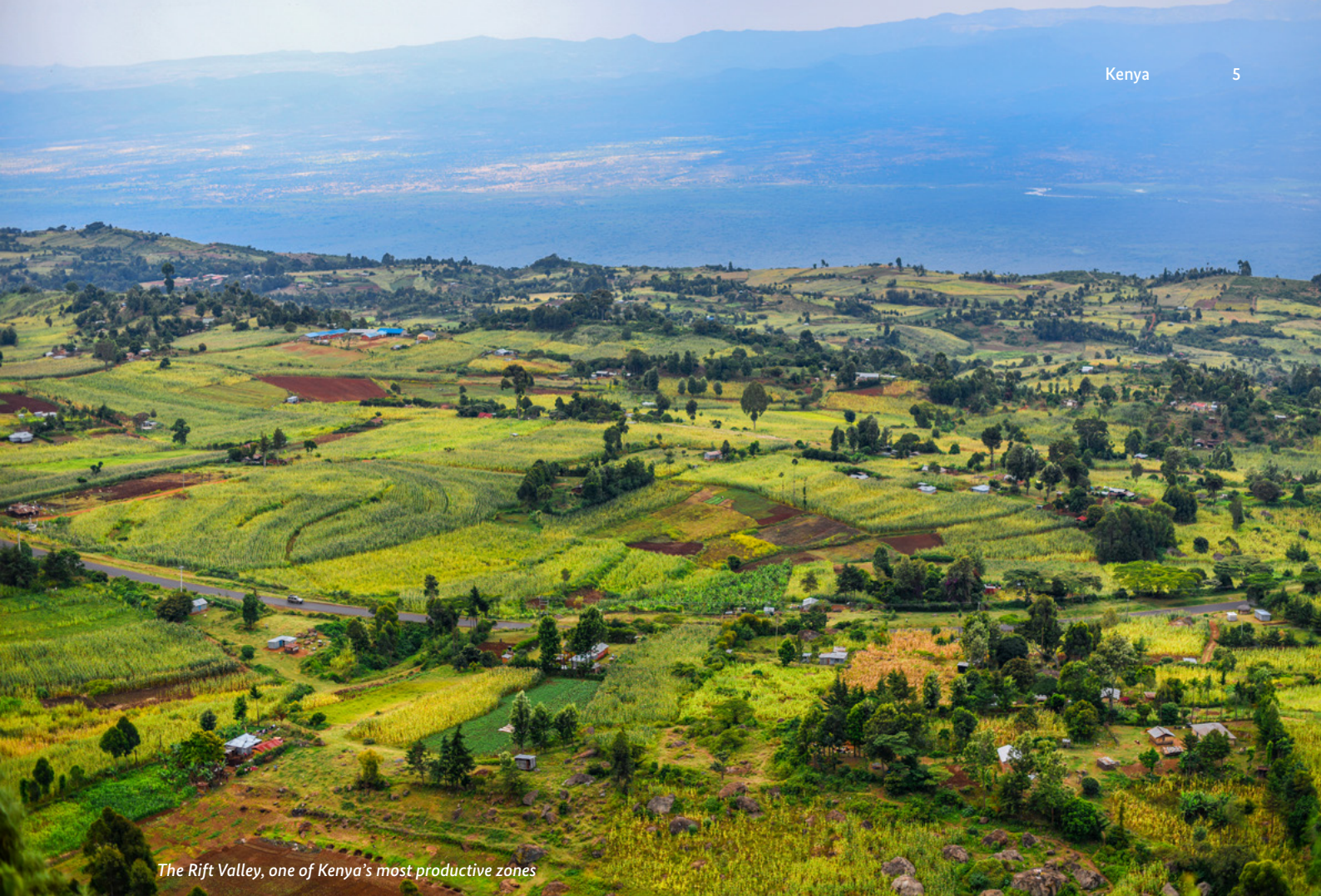
The Rift Valley, one of Kenya's most productive zones