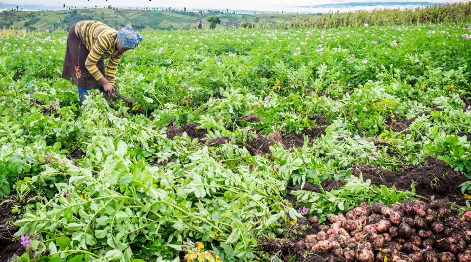
Smallholder potato farmer harvesting