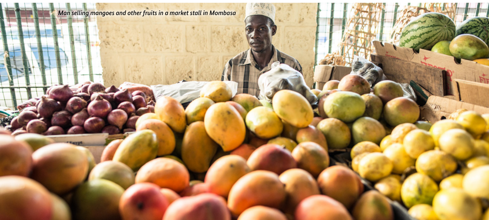
Man selling mangoes and other fruits in a market stall in Mombasa

The Swiss Agency for Development and Cooperation (SDC) supports ecological organic agriculture; the Swiss Biovision Foundation is active in organic and agroecological knowledge management and livelihood development. The Danish Cooperation supports agroecology and organic research as well as institution building.