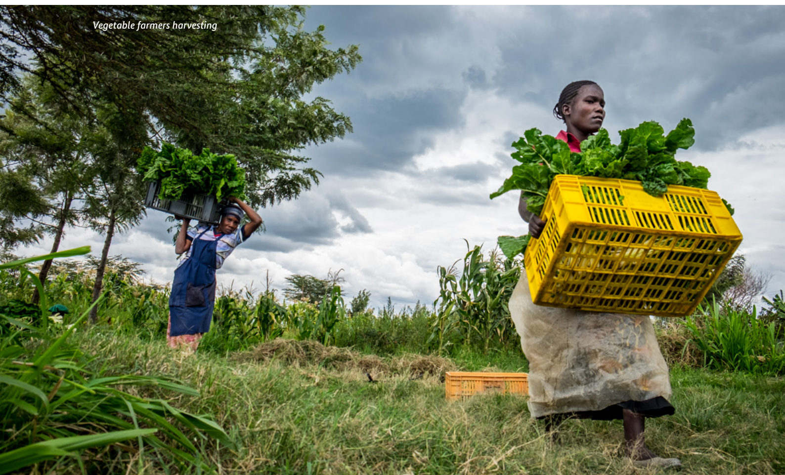
Vegetable farmers harvesting