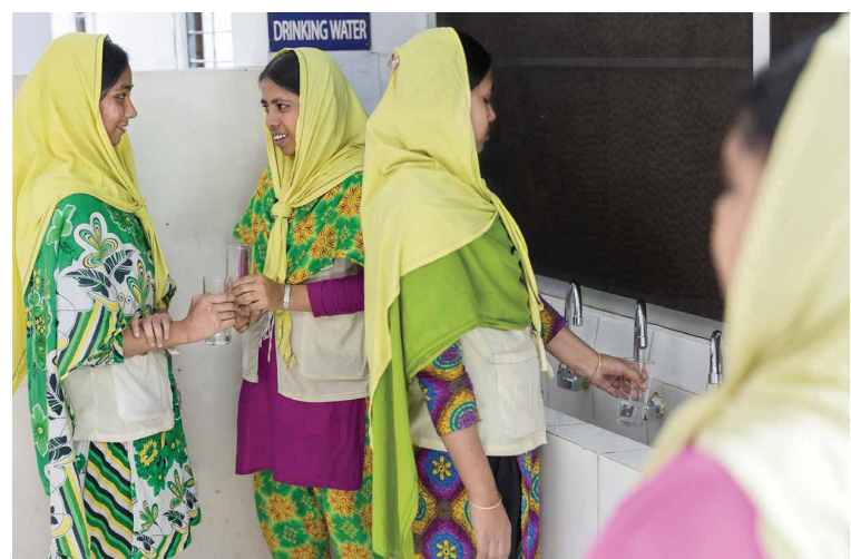
Employees have access to safe drinking water, which is a legal requirement and contained in most codes of conduct provided by buyers