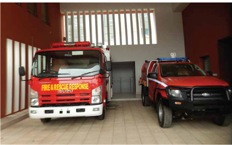
The estimated value of saved property in the first year of the Mini Fire Brigade's operation is about EUR 2.4 million.