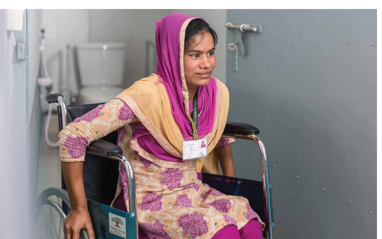
Skill development, comfort and acceptence at work - a washroom for employees with disabilities.