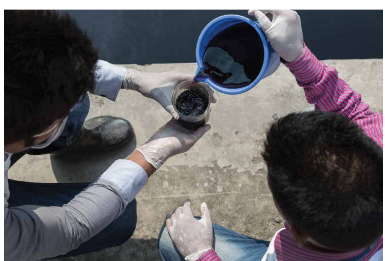
To maintain environmental standards water samples are being collected for analysis