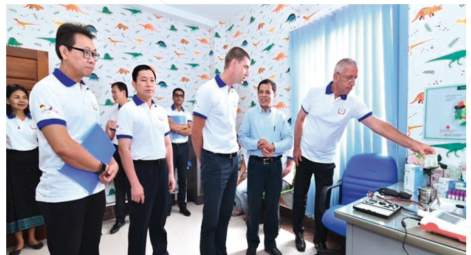
Launching the Type 1 Diabetes Clinic at the Cambodia Korea Diabetes Center

Counterfeit products and parallel imports of licensed products remain an issue for both prospective businesses and Cambodian patients. The sale of counterfeit products has expanded online and involves commonly used lifesaving medicines, such as antibiotics, analgesics and antiparasitics. The Cambodian Government has created an ad hoc body, the Counter Counterfeit Committee (operating within the MoC), that has succeeded in seizing tonnes of fake medical products and drugs. However, the unaffordability of licensed medicines for many, a desire for cheap medicines and a lack of consumer awareness contribute to the spread of these counterfeit products. A promising trend is that unlicensed pharmacies are gradually disappearing in Cambodia, especially in Phnom Penh. They have either been shut down by the authorities or have managed to become formally accredited, thus slowing the sale of counterfeit medicines. Regulatory efforts have also been stepped up across the country, but this issue remains particularly challenging in rural areas.