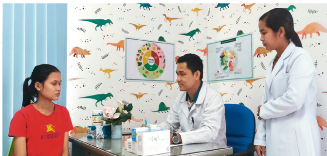
Type 1 Diabetes Screening at the Cambodia Korea Diabetes Center

The registration license is valid for three years. Applications for the renewal of licences must be submitted six months prior to the expiry date with a sample for laboratory testing. All imported pharmaceutical products must have at least 18 months left before the expiry date. The registration of new drugs is also monitored by the MoH, and they must undergo clinical trials.