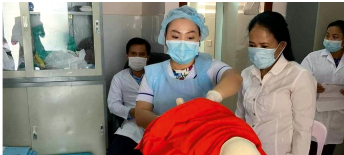
Coaching by GIZ on new-born care at a Baray Sontok Hospital

The first case of COVID-19 in Cambodia was identified on 27 January 2020. As of 13 July 2021, 62,700 cases and 953 related deaths have been recorded. The fact that Cambodia is faring somewhat better than most of its regional neighbours (except Laos and Vietnam) can be attributed to a string of factors, according to health professionals. These include the lack of conventional public transportation in Phnom Penh and a form of “natural” social distancing behaviour based on cultural habits. Cambodians typically have tighter-knit family groups, with relatively little interaction outside of them. Following a drastic increase of confirmed cases in Phnom Penh in April 2021, the government also declared a hard lockdown in many parts of the capital until the beginning of May 2021. Furthermore, Cambodian authorities have disseminated information to those living in remoter areas, providing instructions via communication channels similar to those used in preventing malaria. Many Cambodians have been voluntarily restricting their movements and social interactions as well. Despite the heavy impact of COVID-19, perhaps one positive development is raising awareness about sanitation and hygiene practices.