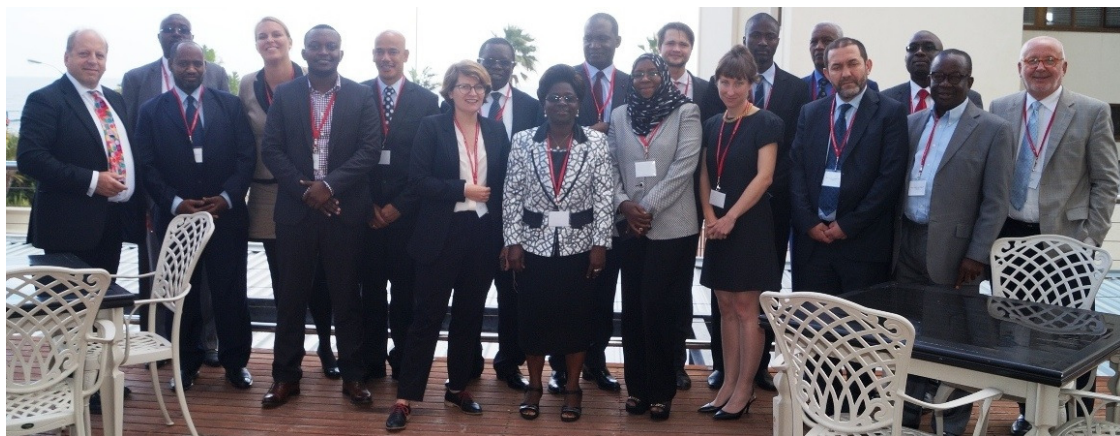
Legislative Oversight practitioners and experts from Cameroon, Ghana, Malawi, Morocco, Seychelles, South Africa, Sudan, Tanzania, Togo, Zambia and Belgium.