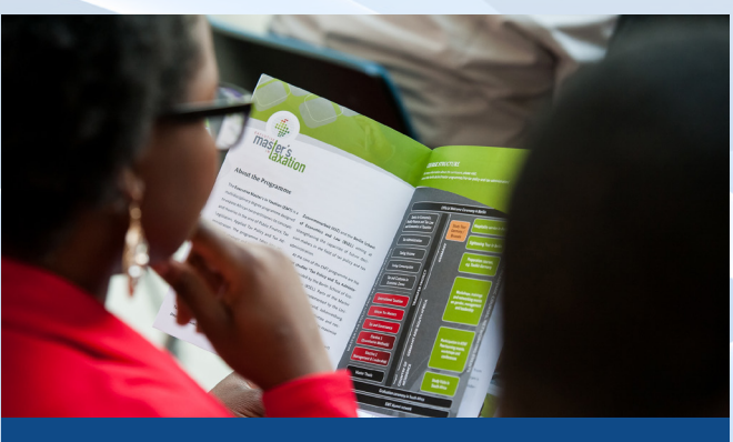
EMT students benefit from two excellent study locations – Germany and South Africa – enabling them to gather experiences from different professional and cultural settings.

The GFG in Africa programme is developing a PFM training course that will provide budget practitioners with the tools they need to make better informed decisions on the allocation of scarce resources in key sectors. It is envisaged to be implemented between 2017 and 2018.