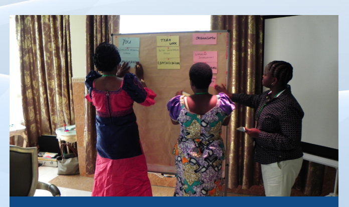
Participants of the Women Leadership Academy are discussing different dimensions of leadership at the launch workshop in Gabon in February 2016.

Research on budget processes and legislative oversight in African countries, initiated by the programme, lays the foundation for peer learning processes and country-specific measures. In 2016, GIZ published an overview study that compared thirteen Anglophone and thirteen Francophone African countries with respect to parliamentary budget supervision. The publication summarises contrasting institutional traditions, settings and experiences, and highlights common and distinctive strengths and weaknesses in each group.