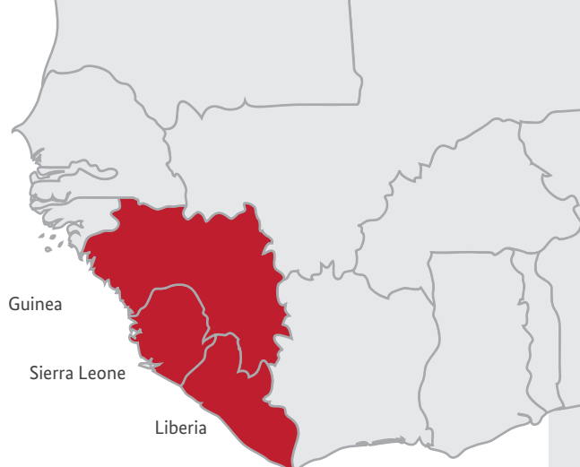
The Ebola epidemic affected Guinea, Sierra Leone and Liberia in West Africa

Such outbreaks are a stark reminder of the crucial importance of pandemic preparedness and the need for early warning mechanisms and trained experts who can respond rapidly to them.