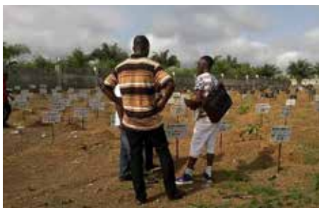
One of the many Ebola burial grounds in Sierra Leone.

Dr Musenero concluded her very moving speech by saying that although no East African deployed experts had died as a result of Ebola, some colleagues and compatriots who had fought alongside them in West Africa had subsequently passed away and she asked delegates to take a moment to remember them. She hoped that they would rest in peace.