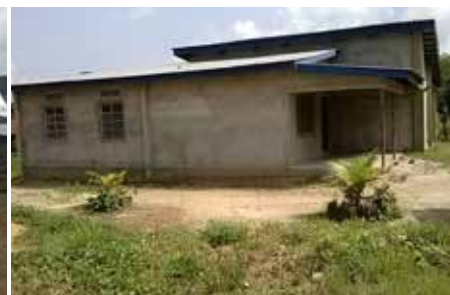
Every single person living in this house died of Ebola.