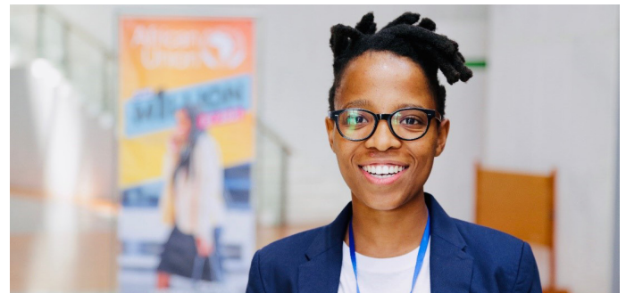
400 Youth from all five African regions came together for the 2nd Pan African Youth Forum to discuss entrepreneurship, engagement, employment and education.

The Youth Division of the Department for Human Resources Science and Technology (HRST) of the AU Commission organized the “Pan African Youth Forum” on the 25th – 27th of April in the AUC Headquarters in Addis Ababa, Ethiopia. Additionally, the “Reach One Million African Youth by 2021” initiative was launched at the Forum, which aims to directly invest in African Youth in four key areas: Entrepreneurship, Education, Engagement and Employment. Having gathered more than 400 youth from across Africa — including 12 Pan African University (PAU) students from all four institutes — with policy makers, entrepreneurs, private sector and practitioners, Africa’s needs and opportunities regarding these four areas were discussed.