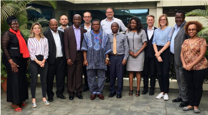
Representatives from the PAU Rectorate and the PAU Institutes' Directors gathered in Yaoundé, to develop a financial sustainability roadmap in line with the Strategic Plan 2020-2024.

In March, the directors and staff of the PAU institutes met in Yaoundé, Cameroon, to work on a fundraising roadmap for the PAU. The process included a training on how to map, evaluate and approach potential funders, as well as on how to organize the budget process considering multiple sources of funding. The participants jointly identified the next steps to be taken and developed a draft action plan towards enhancing the financial sustainability of the PAU. Accordingly, these technical preparatory meetings serve as a crucial stepping stone for the elaboration of a financial sustainability roadmap