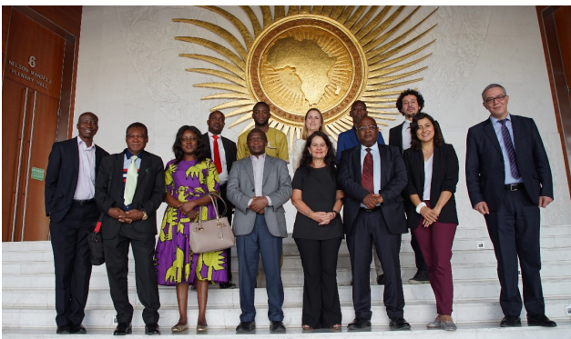
The PAU Institute directors and a representative from the Rectorate met with communications expert at the African Union in Addis Ababa to consolidate the PAU's external communication strategy.

In February, as part of a process to strengthen the PAU's communication and public relation activities, the PAU institute directors, representatives from the PAU Rectorate as well as the communication officers of all institutes jointly planned the PAU website development process and decided on its structure. Three international communication experts will continue to support the PAU in strengthening its communication strategy and aligning communication channels and products across all PAU Institutes.