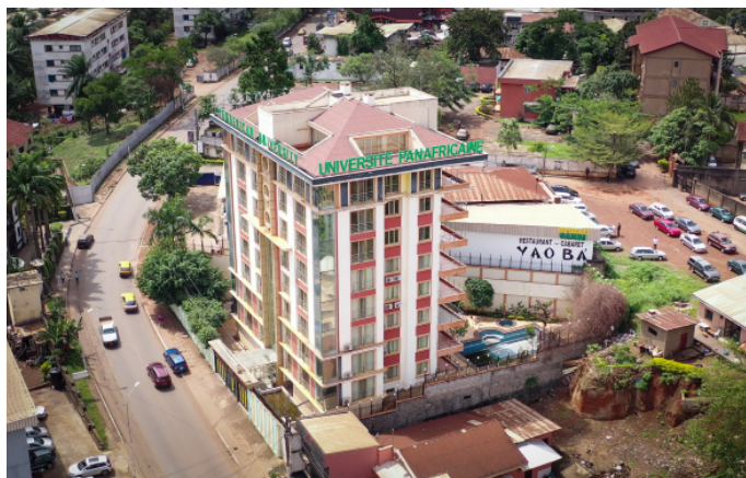
The Pan African University Rectorate in Yaoundé, Cameroon.