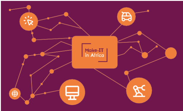
African start-ups develop future-oriented digital solutions and products for all sectors.