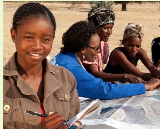
Participatory mapping of land parcels in Namibia

The program supports the establishment of this degree course. A revision of the curricula was undertaken and recommendations for the adjustment of the program in line with international standards and based on NELGA guidelines, were developed in cooperation with the Technical University of Munich (TUM) in 2016. Furthermore, the TUM will support the implementation of the PhD program from now on, i.e. through guest lectures and by supervising PhD theses. Moreover, scholarships for the new education program in Bahir Dar are being granted via DAAD, which is open for applications for postgraduates from all over Africa. Hereby young Africans, as well as cooperation and knowledge sharing between African universities are promoted.