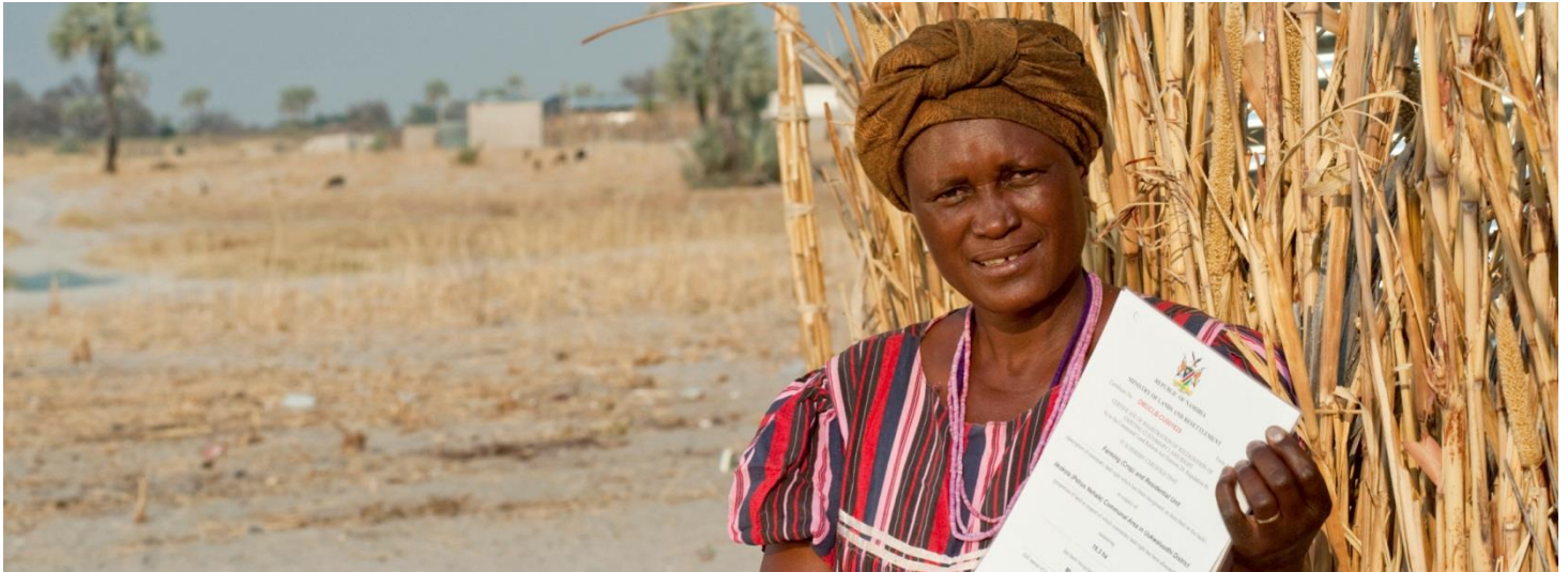
Smallholder farmer in Namibia presents legal land title.