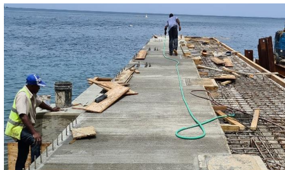
Active construction phase of the berthing jetty in Soufriere Bay, Dominica.

The jetty, designed to function as a multi-purpose facility was informed by broad community consultations, preliminary data collected on site, biophysical factors, and cost considerations. Owing to the absence of any ground data, test piling was done to determine load bearing capacity, which at minimum would accommodate an emergency vehicle for any rescue operation. Much of the construction work was completed by Dominican engineers and locals employed from the community under the supervision of Inros Lackner. To ensure that the structure can survive sea swell and hurricane induced waves, deck stands 1.5 m above mean sea level. To allow for the berthing of the local small fishing boats, a lowered platform was added to the southern side of the jetty.