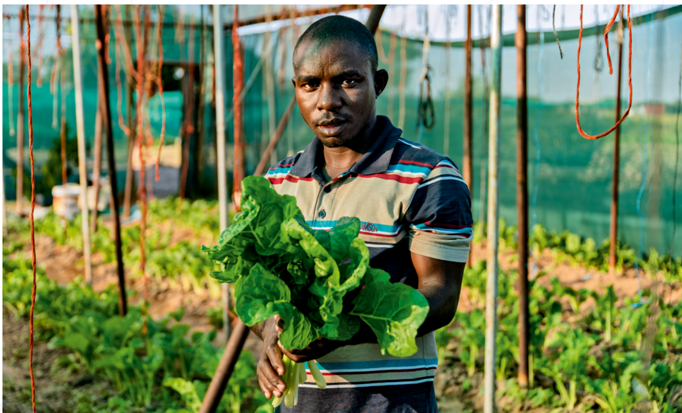
Urban Horticulture in Outapi, Omusati Region

Organic agricultural methods are internationally regulated and legally enforced by many nations, based in large part on the standards set by the International Federation of Organic Agriculture Movements (IFOAM), an international umbrella organization for organic farming organizations. The Namibian Organic Association is affiliated with IFOAM. The Namibian Standard was developed in line with a standard compliant with the IFOAM Standard, which