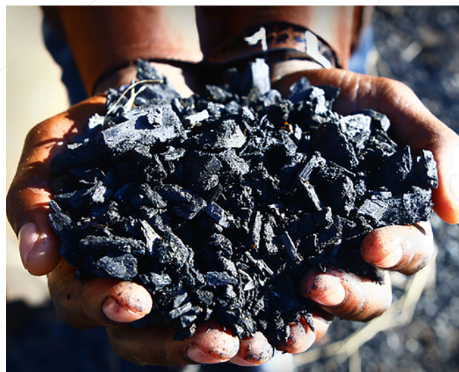
Charcoal produced from Namibian encroacher bush

Namibia has a well-established charcoal sector, which ranks among the top wood charcoal exporters in the world. Charcoal production is an important activity for managing bush encroachment while simultaneously restoring rangeland. Charcoal exports have increased from 10.3% in 2018 to 16.8% in 2019 of total agricultural exports. Namibia is ranked number six out of fifteen countries that exported the highest dollar value worth of charcoal during 2019. This also makes the country the largest exporter of charcoal in the Southern African region. The charcoal value chain is well organised and the bush harvesting process is firmly regulated.