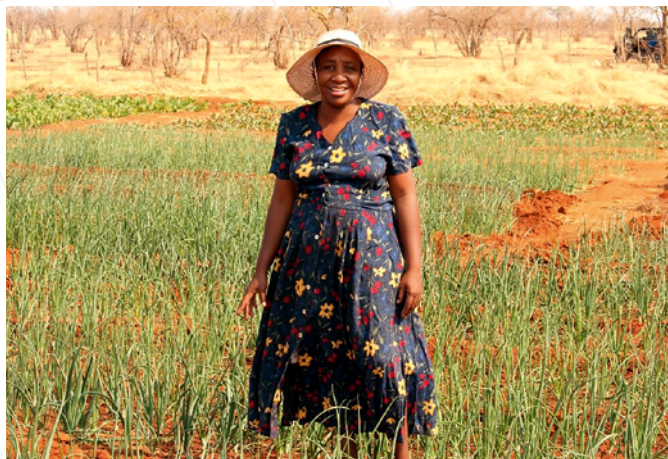
Farming at the Otjejekua Farmers' Cooperative in the Kunene Region

The government remains committed to a "willing seller, willing buyer" approach to land reform and the provision of just compensation as directed by the Namibian constitution.