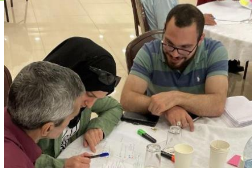
Left: Launch of digital advocacy campaign to promote rights of people with disabilities to inclusive education, Atfaluna, CSP's partner organisation, October 2022, Gaza, Palestine.