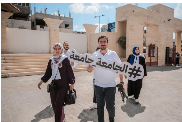
Participants of the "Inclusive University Campaign" organised by the Social Development Forum (SDF), CSP's partner organisation, Gaza, Palestine, September 2022.

Introducing innovative measures to support CSOs work as governance actors in fields such as digitalisation or Leave No One Behind (LNOB) methodologies in the spirit of the 2030 Agenda.