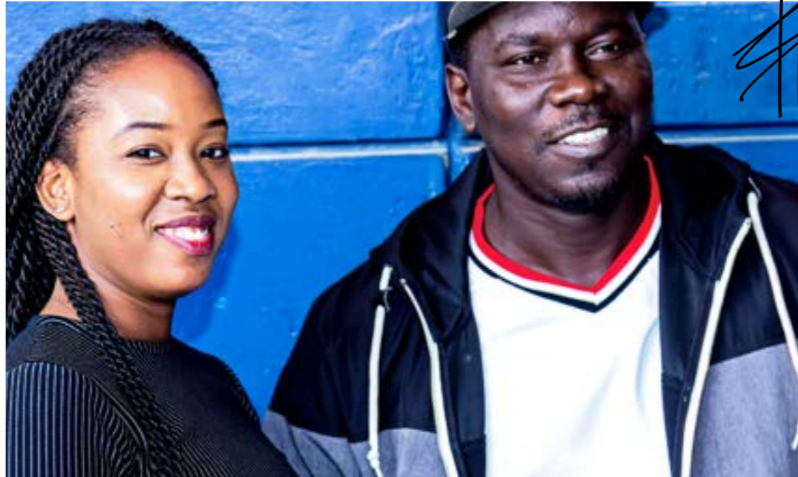
Since its creation in 2006, Africulturban has been an advocate for urban cultures, especially promoting hip-hop through several venues.