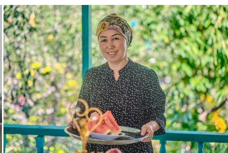
L. to r.: Women’s cooperative “Jany-Jol asyldary” in Aksy district produces canned products made from organic berries and fruits.