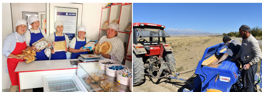
L. to r.: Women's startup in Taldy-Bulak village of Bazar-Korgon provides local women with job in confectionary and sewing workshops.

Together with our partner NGOs, we support local producers in joining into producer groups and cooperatives to share costs for input, to improve quality and increase volumes ready to sell.