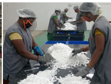
L. to r: Sorting of textile waste, textile sorting centre and cutting of textile waste.