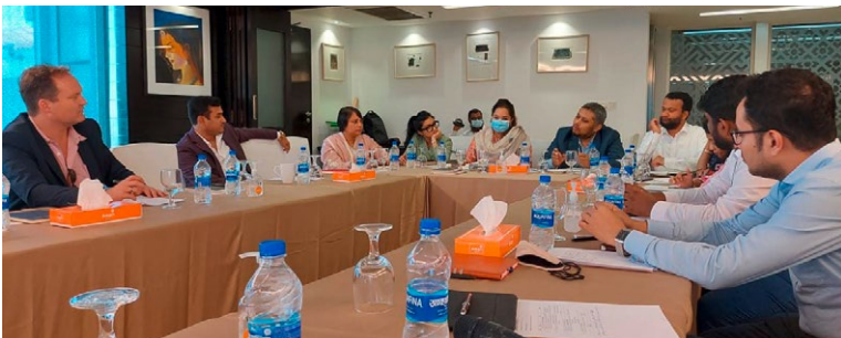
Nearly 30 people took part in the roundtable in Dhaka