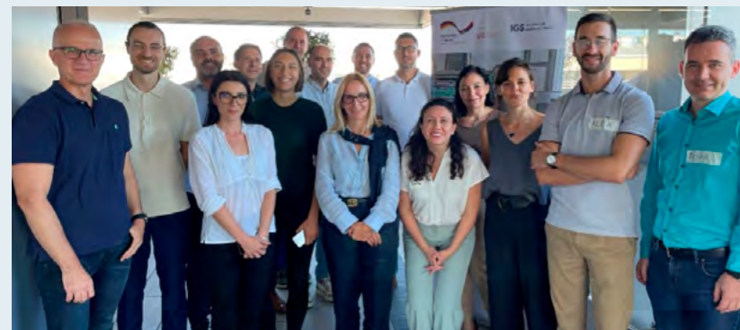
Group of selected consultants that was trained in carbon management services

Following the event, a group of Serbian consultants was trained to effectively implement carbon management systems at supplying companies in Serbia. After the trainings, the consultants will advise their first clients on carbon management according to recognised methodologies and in line with the latest developments in climate science and the requirements of European legislation.