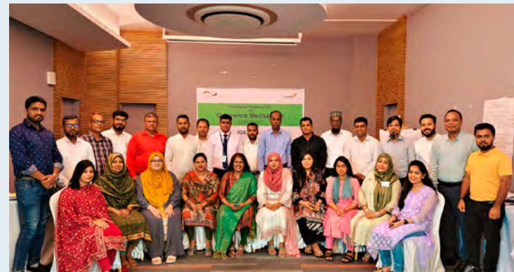
Participants of the ToT on Grievance Mechanisms

In the ToT on grievance mechanism, 24 master trainers from BKMEA, BGMEA and worker organisations were trained on the topic of in-factory grievance mechanisms. The ToT was conducted in partnership with ILO Better Work Bangladesh. Moving ahead, the master trainers will deliver grievance mechanism trainings to both factory management and worker representatives across 120 ready-made garment factories in Bangladesh. The objective is to strengthen their in-factory grievance mechanism structures while including a gender-sensitive approach.