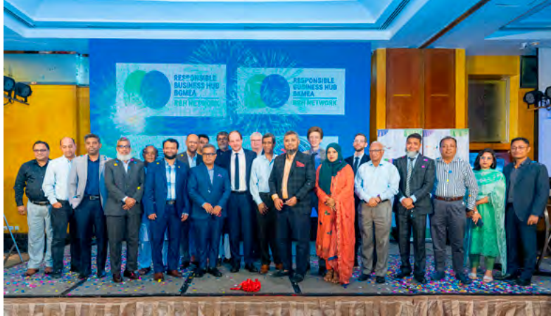
Launch of the RBH in Bangladesh