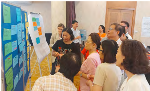
Participants of the second ToT