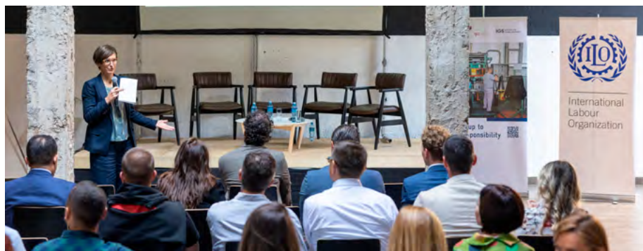
Opening panel during the conference