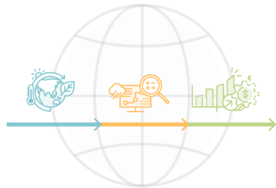
Figure 1. CRED Process: Enabling climate-sensitive economic policies

The CRED programme promotes international exchange by sharing project experience and developing communication materials. The aim here is that macroeconomic models for adaptation planning should be used beyond the partner countries. For this purpose, CRED is cooperating with another GIZ programme called DIAPOL-CE in Nigeria and Mongolia to support modeling capacity building.