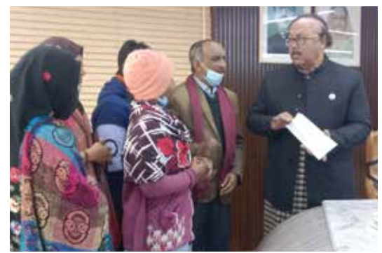
An Application is being submitted to the Mayor of RCC to solve the waterlogging problem (road & drainage issues)

The Court Station Bilsimla slum faced challenges due to a lack of access to safe drinking water. The number of tube wells was insufficient and many were unusable. In the Court Station and Tultuli Para slums, the tube wells were often submerged in dirty water, making the water unsafe to drink. As a result, residents had to rely on tap water, which had a high leakage rate. This led to health issues and financial burdens for the residents.