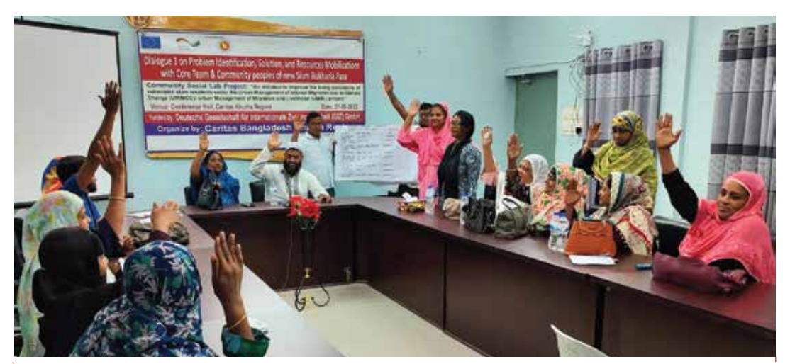
In consultation with volunteer and core team members the problems are prioritised.