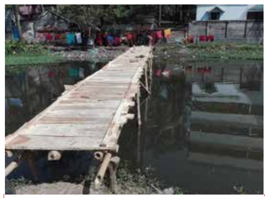
Wooden bridge is in under construction