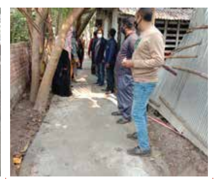
Members of the core team visiting the constructed road.