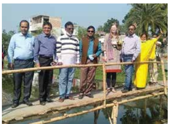
Representatives of Caritas Bangladesh and GIZ visit wooden bridge in Satkhira