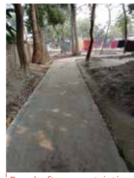
Road after constriction