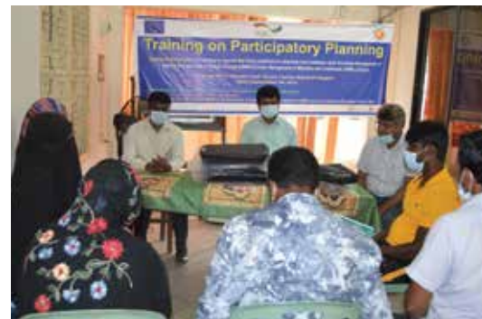
Volunteers are participating on Participatory Planning Training at RCC