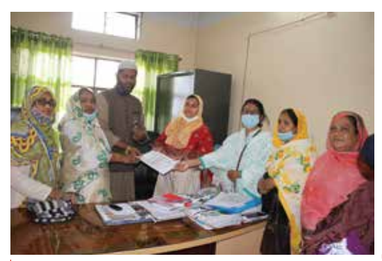
Submitting application to conservancy department for waste collecting van (vehicle)