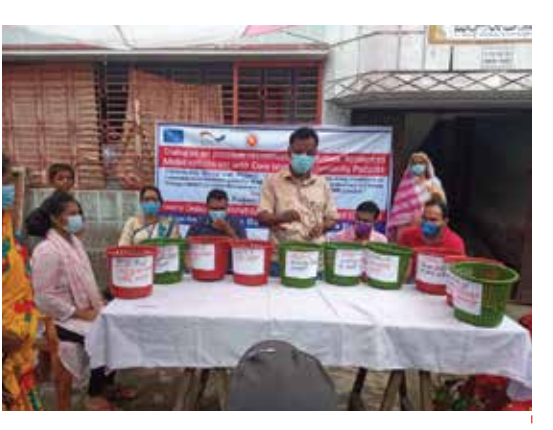
Prioritising problems by voting

During the first dialogue in September 2021, 10 problems were identified, including few safety net programme facilities, lack of skills for self-employment, few facilities to wash the dead persons of the slums. During the second dialogue, the lack of a bridge was prioritised and it was agreed to construct a wooden bridge. Previously, residents had to cross the canal on rafts, which was risky and costly.