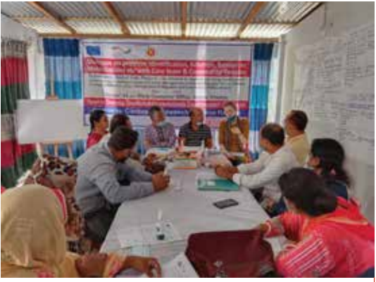
Sharing about activities.

During the 1st dialogue, held on 10/08/2021, eight problems were identified, including road problems, lack of sanitary toilets, lack of safe water, drainage problem, lack of streetlights, waterlogging, high youth unemployment, and malnutrition/lack of awareness about the needs of pregnant women.