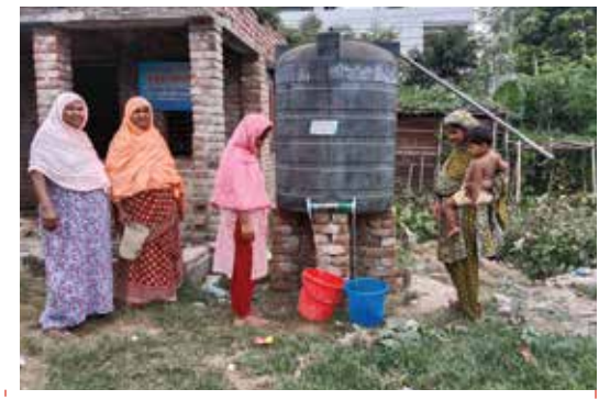
Slum People are Collecting Drinking Water from Submersible Pump at Court Station Slum, RCC