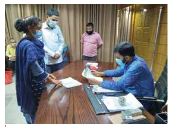
Submitting proposal to Mayor, Satkhira Municipality for construction of bamboo bridge over the river