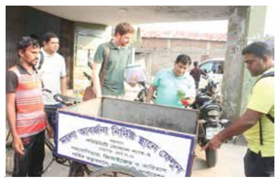
GIZ representatives view the result