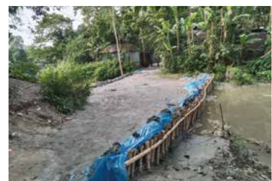
After earth filling, the road is visible