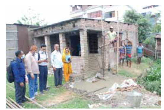
With the financial support of a charitable person, the submersible pump is being installed for safe drinking water at Cour Station Slum, RCC