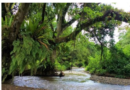
L. to r.: Woman from sericulture cooperative cleaning silk; Forest in Chebera Churchura National Park.