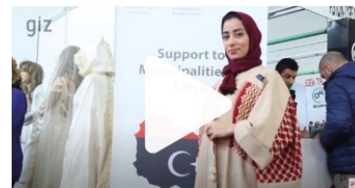
Video: Libyan women at the InterTEX Tunisia

» For more on this project, see GIZ's Integrated Company Report